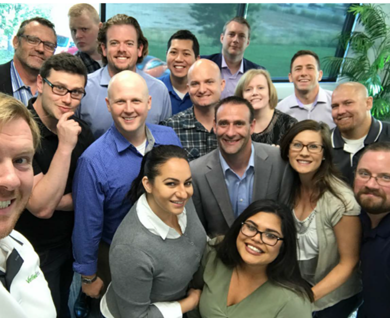
The leadership team at Verified First, after taking a Strengths Finders workshop. We know great leaders can identify and grow great employees. We are committed to growing the skills and abilities of our staff, from entry-level to our top leadership.

Even if you have great vision, a lack of great people can still create a mediocre company. Our founders took this advice to heart not only when building the team for Verified First, but also when determining our company's purpose: To make companies great by helping them make effective hiring decisions.