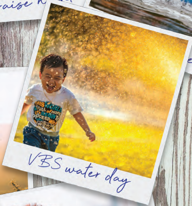
VBS water day